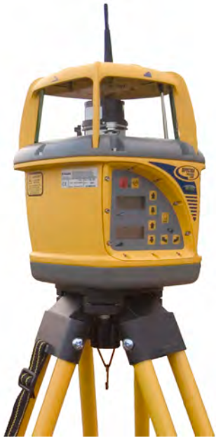
GL722 Grade Laser

For the GCS900 2D AND For the GCS900 3D with Laser Augmentation