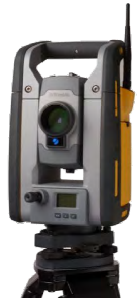
Universal Total Station