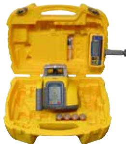
Complete system carrying case includes tripod and your choice of grade rod.

Standard case with laser and receiver only also available.