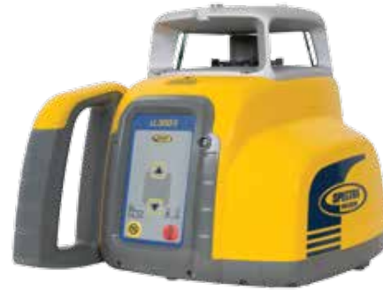
LL300S features a strong metal sunshade