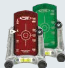
956 / 956G Optically Enhanced Target