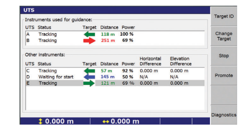
Trimble Hot Swap keeps the paver moving

Data preparation for concrete paving projects is easy with Business Center – HCE software. You can create a 3D construction model and virtually "drive through" it to address any potential issues before you start paving.