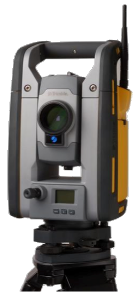
Universal Total Station