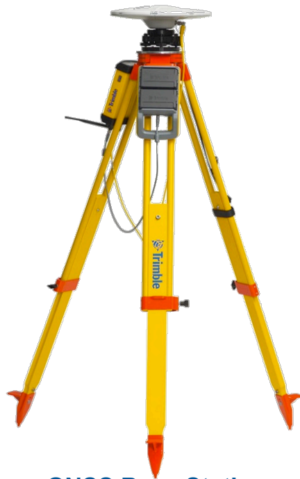
GNSS Base Station

For the GCS900 3D with GNSS OR GNSS and Laser Augmentation