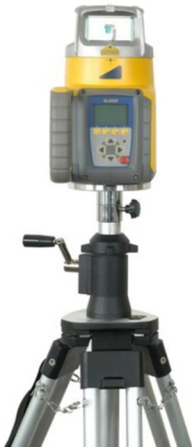
GL600 Grade Laser

For the GCS900 2D AND For the GCS900 3D with Laser Augmentation