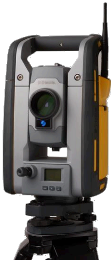
Universal Total Station