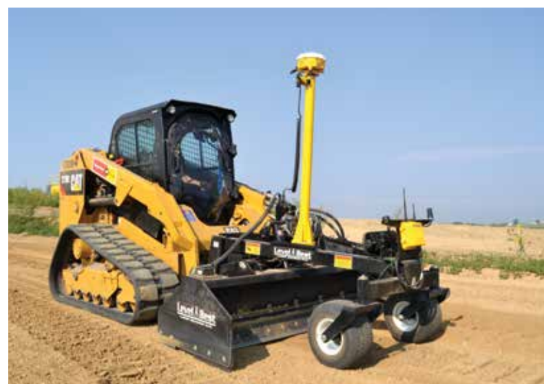
ATI Level Best PD Series Grading Box and Trimble GCS900 Grade Control System with Single GNSS