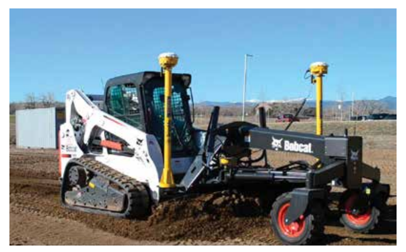
Bobcat with HD Grader Attachment and Trimble GCS900 Grade Control System with Dual GNSS