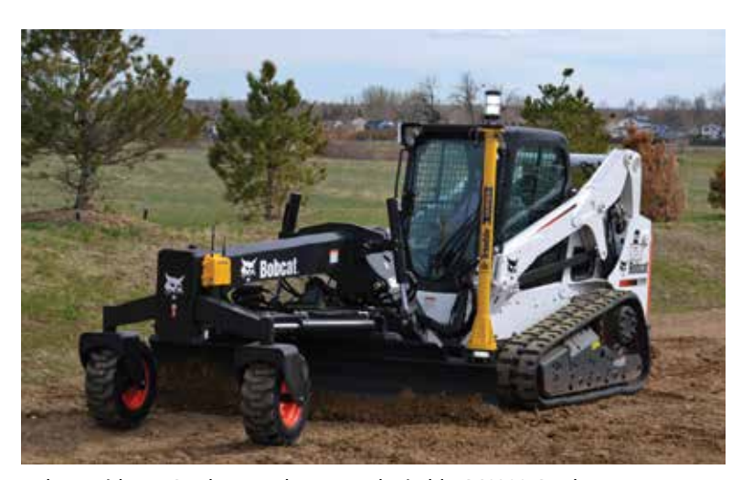
Bobcat with HD Grader Attachment and Trimble GCS900 Grade Control System with Universal Total Station